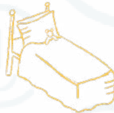
£30 Bedding Bundle