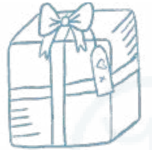
£100 of Christmas Gifts